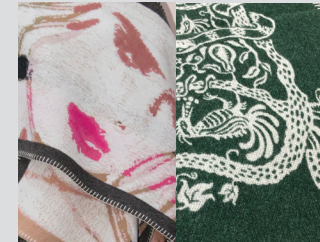
'FINE MERINO JACQUARD DOUBLE CLOTH'

SEE REVERSE FOR FULL RANGE OF BESPOKE THROW & BLANKET QUALITIES