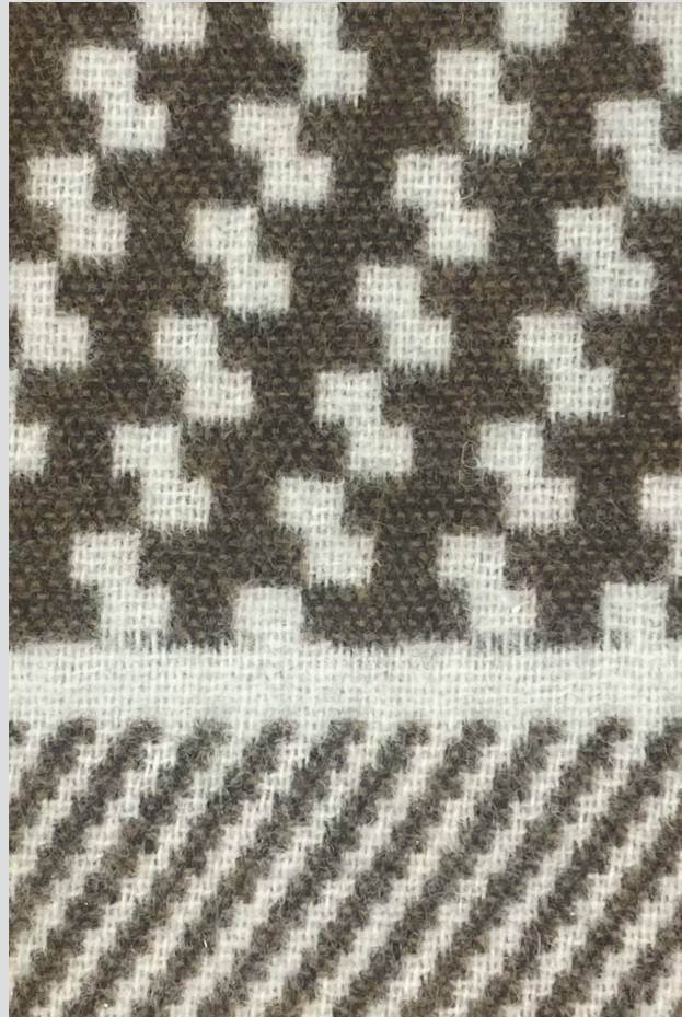
FINE MERINO JACQUARD DOUBLE CLOTH

CONTACT US TODAY TO DISCUSS YOUR UNIQUE REQUIREMENTS