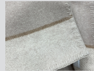
'FON MERINO BLANKET'

SEE REVERSE FOR FULL RANGE OF BESPOKE THROW & BLANKET QUALITIES