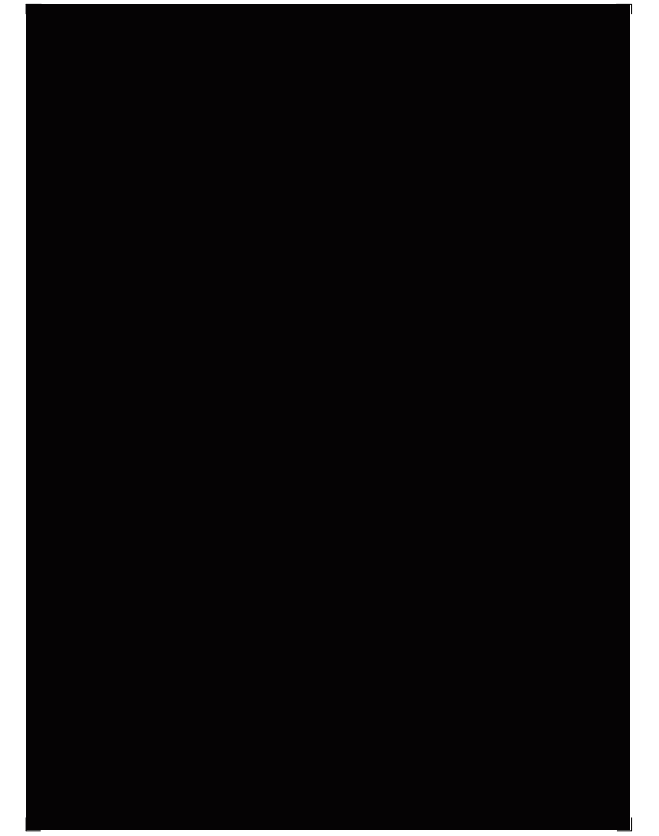
FINER WEIGHT BLACK